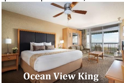
Ocean View King

All of our rooms come equipped with a coffee pot, mini fridge, microwave, pillow-top mattress, flat screen TV, DVD player, iron, ironing board, and AM/FM alarm clock.